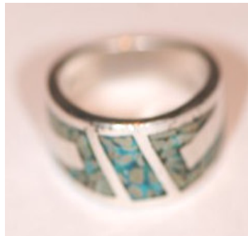
Fred C Silver Ring