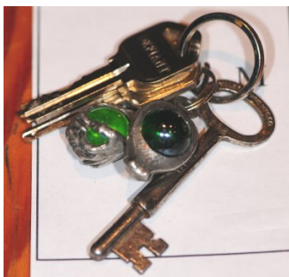
Fred C Set of Keys