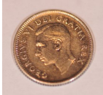
Fred C 1946 Silver Dime