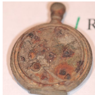
Fred C Old Pocket Watch