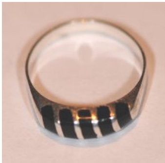
Dave C Silver Ring