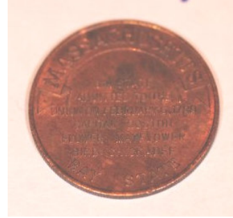
Fred C Massachusetts Hunting Token